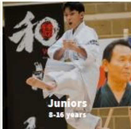
Juniors 8-16 years