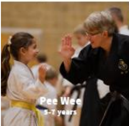
Pee Wee 5-7 years