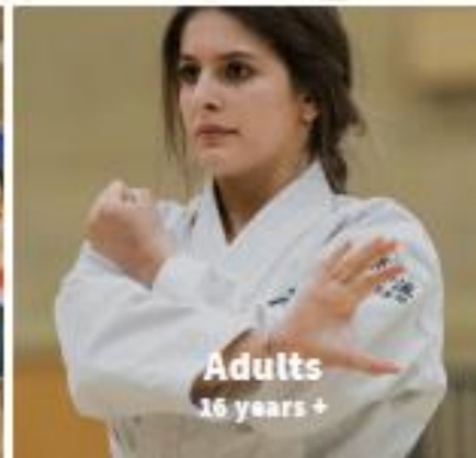
Adults 16 years +